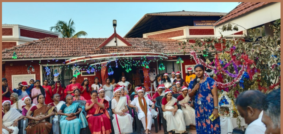
NSS Unit celebrated christmas at Kasthurba Old Age Home.