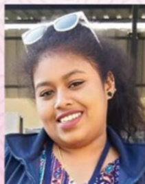
അനാവിക എം ആർഗ്ഗ് ക്ലബ്ബ് സെക്രട്ടറി