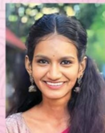
അക്ഷര സി.ജെ മാഗസിൻ എഡിറ്റർ